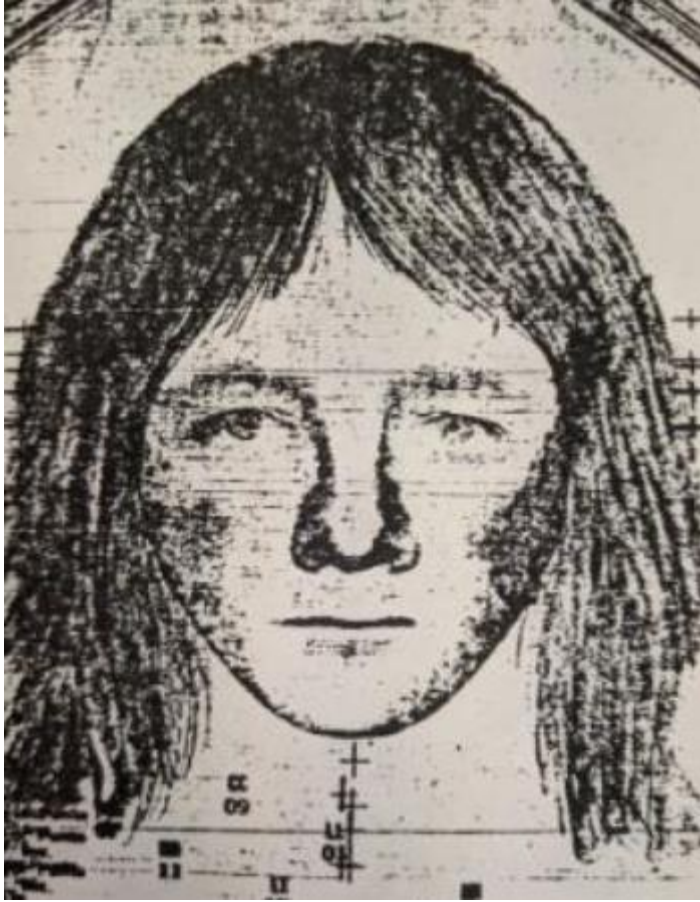
Photo 3 Description: Artist sketch based on remains found in Millard County rendered August 19, 1979. (Millard County Sheriff's Office)